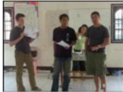
Participants in the Psychology Training