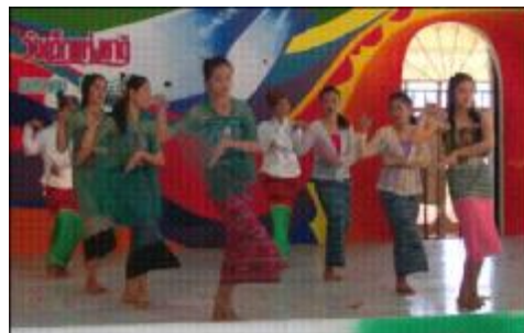
Children Perform at DEPDC Children's Day festivities

The next day the resident DEPDC children, staff, and a few of the foreign volunteers, boarded the bus at 8am for a two hour journey to Mae Suey where a special fair was being held. The children were treated to craft workshops, puppet shows, musical performances, and some current films, as well as a variety of races to take part in and of course the ever present selection of tasty treats.