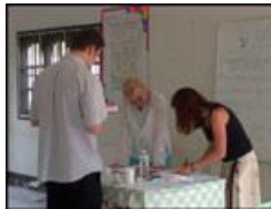
Preparing for the Workshop

on child development, behaviour management skills, counselling skills, working with children, families and the extended community, children's rights, therapeutic activities and child trafficking.